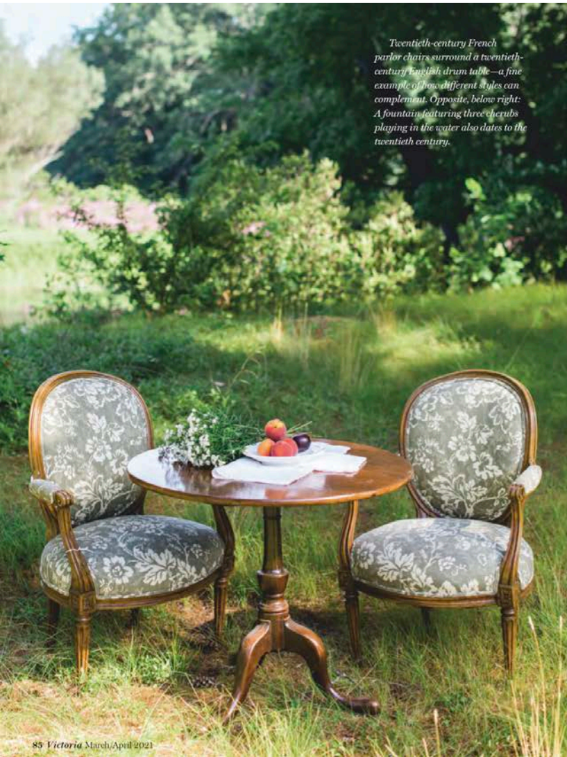
Twentieth-century French parlor chairs surround a twentieth-century English drum table—a fine example of how different styles can complement. Opposite, below right: A fountain featuring three cherubs playing in the water also dates to the twentieth century.